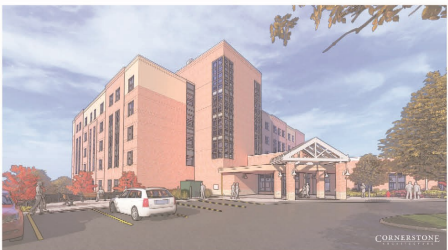
Ajax - The Village of Millers Creek