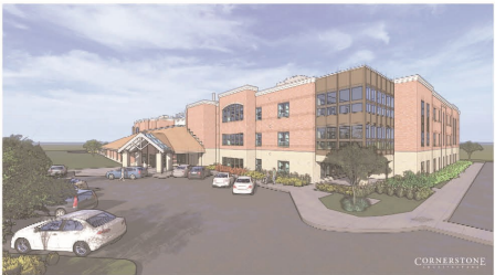
Milton - The Village of Ridgeview Court

*All drawings on this page are conceptual renderings. Actual views may vary and cannot be guaranteed.