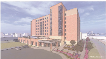
Ottawa - The Village of Riverbank Terrace