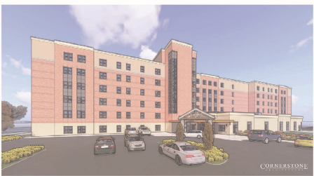
Stouffville - The Village of Stouffer Mills