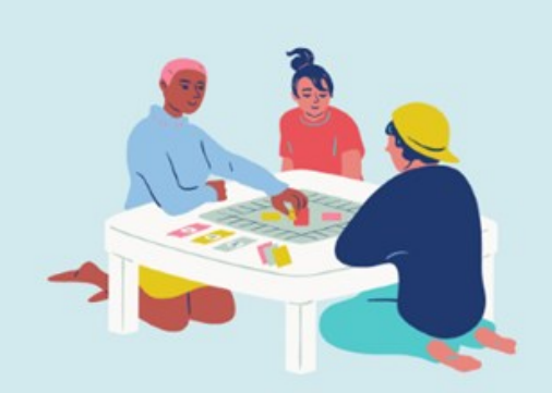
Play games with friends