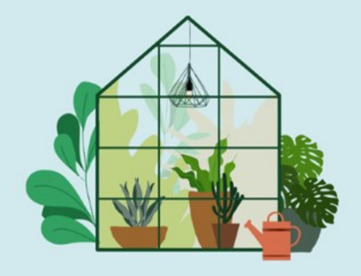
Visit the greenhouse