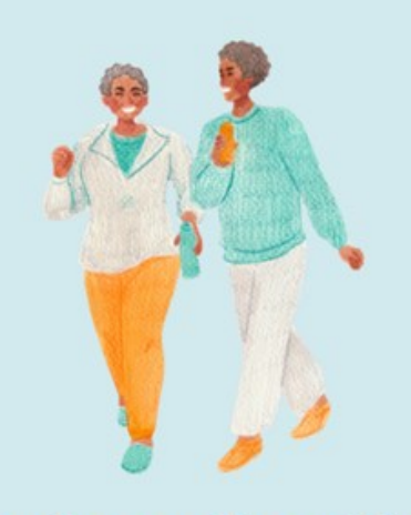
Go for a walk outside