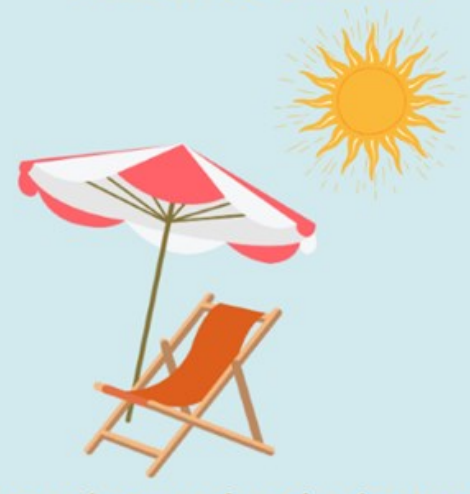
Spend some time in the sun