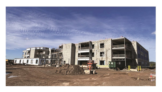
The Village of Ridgeview Court, Milton

After extensive renovations, Winston Park's grand reopening in the fall of 2024 was a time to celebrate the culmination of efforts that led to a state-of-the-art, 288-bed Long-Term Care (LTC) community on the footprint of the Village that launched the Schlegel Villages organization as it is known to this day.